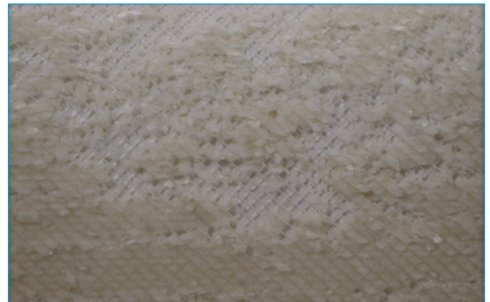
Severe scaling within feed spacers

The original wells which had been selected were abandoned in favor of different wells. However, the water quality of the new wells was unknown and the antiscalant selection and dosage had been based on the original water quality. Furthermore, there were several incidents of antiscalant dosing interruptions, and operation at a recovery rate beyond the design recovery. The feed pressures started to rise suggesting that scaling was forming, and differential pressure across the system climbed to 68 psi (4.7 bar). Permeate water quality was deteriorating as conductivity quickly climbed.