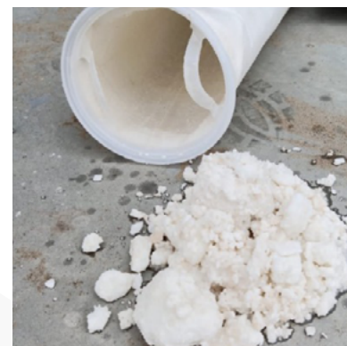
Disintegrated gypsum scale collected in the bag filters.